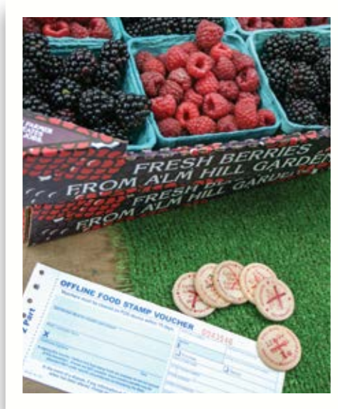
WIC Checks and Tokens at the University Place Farmers Market, Tacoma, WA

state, with a system called Electronic Benefits Transfer, or EBT. In Washington, when a Food Stamp recipient purchases food using their benefits, they swipe a card, called a “Quest” card, in the same machine as they would a debit or credit card. The magnetic stripe on the back of the Quest card accesses the recipient’s benefits account and transfers the purchase amount to the grocer’s account.