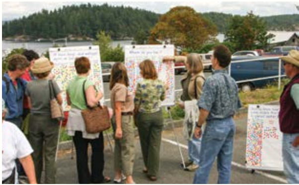
Dot Survey, 2004 Rapid Market Assessment, Friday Harbor, WA

Team website at www.smallfarms.wsu.edu for more information and local contacts.