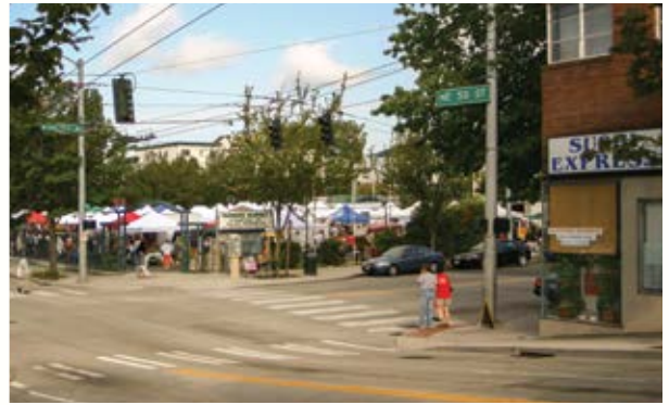
University District Farmers Market, Seattle's oldest and largest "farmers-only" neighborhood market

Because technology is evolving and continual improvements are being made to safety equipment and canopy anchoring systems, the WSFMA is exploring the use of auger anchors to secure tent canopies. Please contact the WSFMA office for current status of auger anchors. As always, if used, care should be taken so that the top of the auger anchor does not present a trip hazard for customers, staff or vendors; and no tie-off ropes or cords are to be left dangling where they could be caught by a passing arm or leg. Please note that the use of non-spiraled tent stakes is not considered an acceptable alternative.