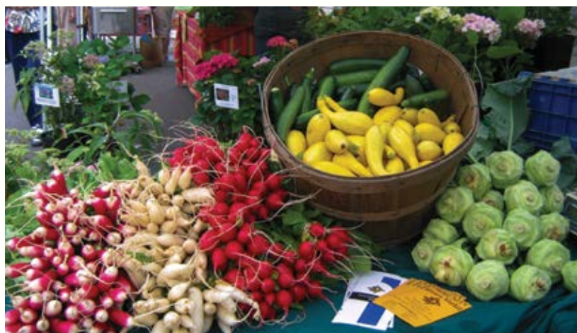
Chehalis Farmers Market, Chehalis, WA

Seniority systems and cronyism tend to be more common at markets with governing boards dominated by vendors. While it is essential to have strong vendor representation, having the board populated entirely with vendors can limit overall perspective and the market's capacity for growth (see Board Recruitment 1.6).