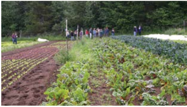
Kirsop Farm, Tumwater, WA sells produce at the Olympia and the Tumwater Farmers Markets

cross-referencing the information provided on vendor applications, managers can assist each other in product verification, while minimizing the intrusion on vendors and assuring all vendors of an even playing field.