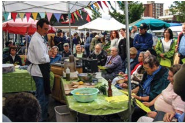
Chef’s Demonstration, University District, Seattle, WA

Marketing the Market Year Round. Markets should be advertising all year. Flower and garden shows and county fairs may have free or low-cost space available for local nonprofits, including farmers markets, to set up informational displays. The market could also work with local gardening groups to do a cooperative plant sale. People attending these events are already interested in gardening or agriculture. Use the event to draw their attention to the obvious connection between their interests and the market. Since flower and garden shows tend to happen in the winter, it is a good time to remind the community that the market season is coming.