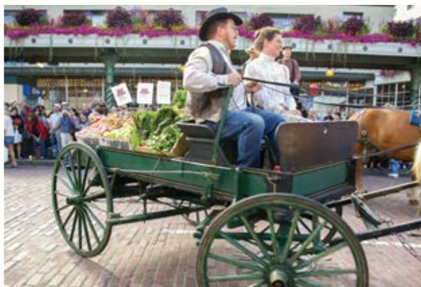
Pike Street Market, Seattle, WA

The economic opportunities created by farmers markets in Washington continue to expand, with new communities adding markets and combined farmer sales reaching over 40 million. And a recent study of the Seattle area found that for every dollar spent at a farmers market, 62 cents was re-spent in the local economy and 99 cents remained in the state (Sonntag 2007). Market stakeholders have been instrumental in prompting changes to local regulatory policies in order