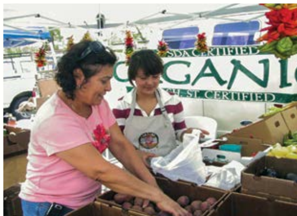
Alvarez Organic Farms, Yakima Farmers Market, Yakima, WA

Waste Management is a significant component of managing a farmers market and it offers an opportunity to practice, and serve as a model for, sustainable waste management practices. The "three R's" of waste management—reduce, reuse, recycle—can perhaps be applied more readily to a farmers market than to most