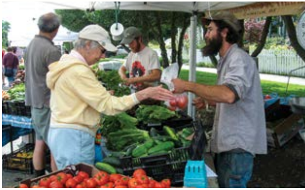
Port Townsend Farmers Market, Port Townsend, WA

against financial loss. For example, the WSFMA requires markets to meet canopy safety standards, including specific language to this effect in their market rules and vendor agreements. The primary reason farmers market coverage remains affordable in Washington is the diligence of managers in keeping their markets safe. (Also see Risk Management Section 2.3.)