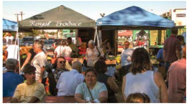
Moses Lake Farmers Market, Moses Lake, WA

Press releases should be short and sweet, fitting on one page. Provide a catchy title and focus on the “five W’s”: who, what, when, where and why. Press releases generate “earned media,” meaning the market gets free attention as a news or informational story, rather than paying for an advertisement. Not only is earned media free, it is also more effective. Many media outlets, large and small, are hungry for positive stories that add color to their community.