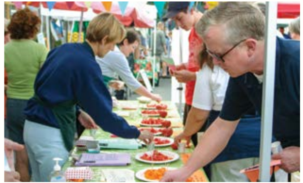
Tomato tasting at University Place Farmers Market, Tacoma, WA

Special events require attention to detail and good planning to be successful. Determine the needs of the market, such as increasing the foot traffic during the late fall, and consider if hosting an event can be a part of the solution. Try to estimate the amount of time it will take to produce this event, and then, double it. Will the amount of effort required be a good exchange for the benefits it will achieve?