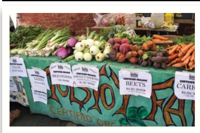
Spokane Farmers Market, Spokane, WA

may need to be made for prepared food vendors such as electrical needs for cooking equipment and local health department regulations.