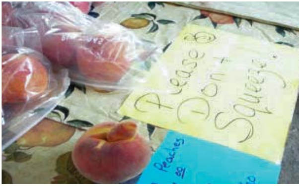
Omak Farmers Market, Omak, Washington