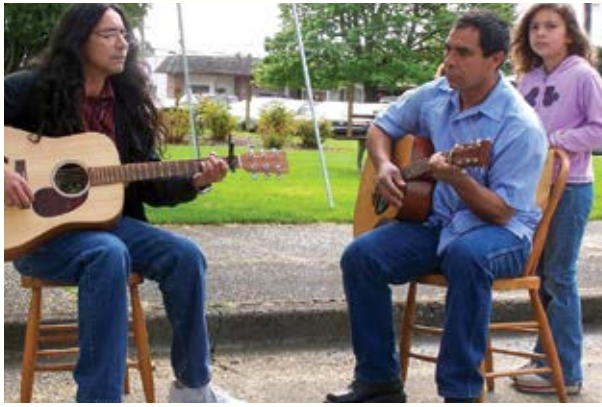
Entertainers at Mason County Farmers Market, Shelton, WA

Organize Farm Tours. Children love dirt, tractors, animals, and the farm atmosphere. Hayrides, corn mazes, pumpkin patches, cooking demonstrations, and the opportunity to meet “Farmer Jones” make for an unforgettable experience for children. The opportunity to show children where their food comes from and how it is produced is invaluable. Market vendors can help identify farms suitable for a children’s tour. Local schools, WSU Extension, or local farm organizations, such as Tilth groups, 4-H clubs, FFA, Farm Bureau or the Grange might help with organizing.