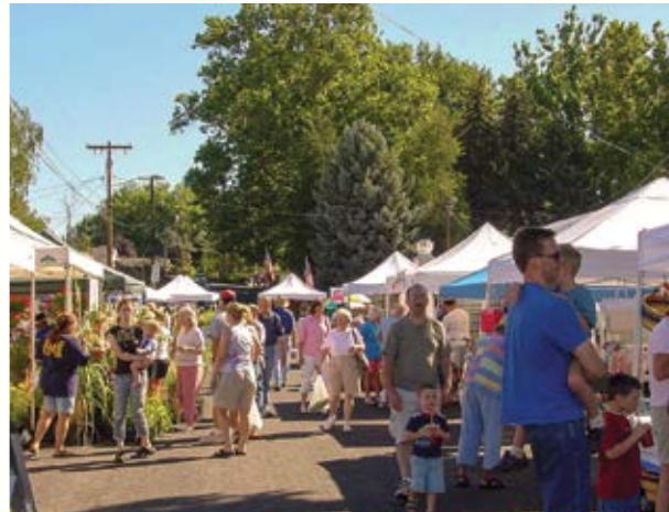
Prosser Farmers Market, Prosser, WA

Keeping Track of Shoppers. Learning as much as possible about customer spending preferences and habits, how they receive information about the market, what motivates them to come to the market, and what keeps them away, is vital to both vendor and market success. There are simple and effective ways to estimate customer attendance. However, collecting other kinds of customer information can feel daunting. Understandably, many people feel shy about contacting strangers and asking them questions about their shopping preferences and behaviors. Market managers can make customer data collection more practical and more fun by using the techniques described in the next section (2.2).