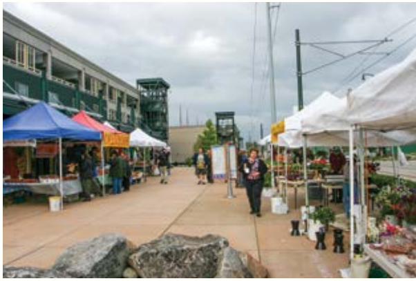
Dome District Farmers Market, Tacoma, WA

Regardless of the market's requirements, individual vendors need this product liability insurance to protect their assets and cover their legal defense costs should a customer become sick after eating their product or sue them for injury or damages arising from market sales. Product liability insurance is sometimes included in or added to a Business Owner's Policy, but does not always cover farmers market activities. Farmers and other vendors should consult with their insurance agent about their specific business needs related to farmers markets.