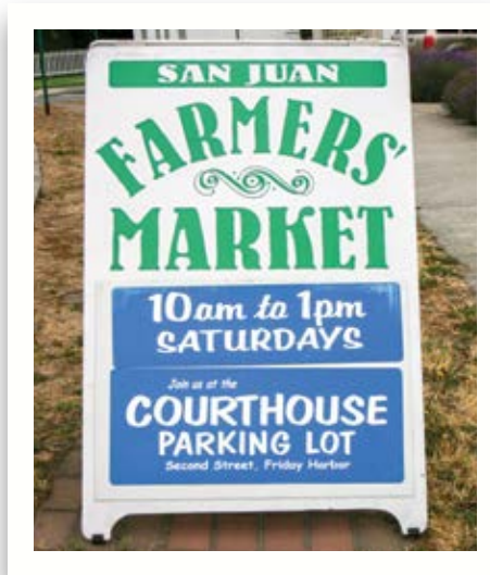
San Juan Farmers Market Sign