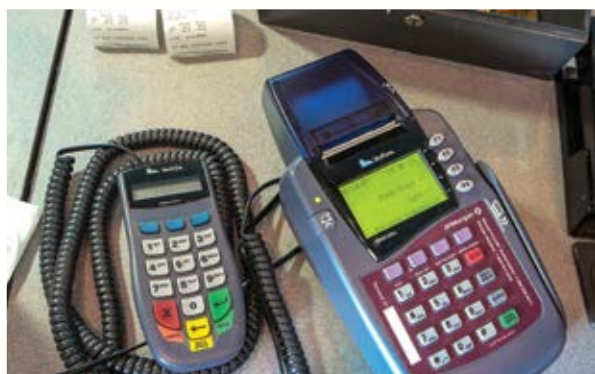
EBT/EFT card processing devices, Olympia Farmers Market, Olympia, WA

It is important to know who your market customers are and understand their needs and preferences. The availability of electronic payment methods and ATM machines can potentially attract new market customers, as well as increase the potential for existing customers to spend more than they had originally intended.