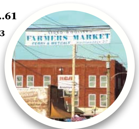
Sedro Woolley Farmers Market Sedro Woolley, WA