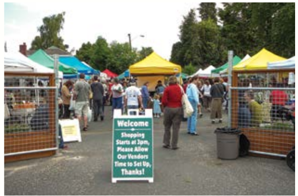
Phinney Farmers Market, Opening Day, Seattle, WA

It is wise to give the organizing team adequate time to prepare—maybe a year or longer. Many building blocks and partners are required for a market to succeed. False starts can create a loss of involvement from potential collaborators and, most importantly, a loss of participating farmers. It is vital that a market’s opening day is a true community happening, with an abundance of customers, vendors and beautiful fresh produce.