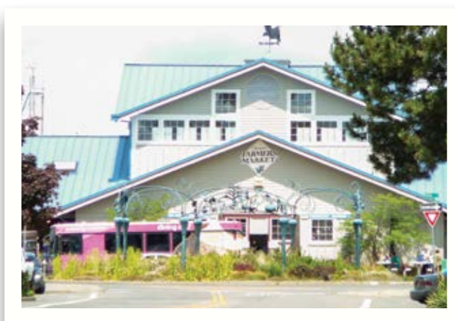
Olympia Farmers Market, Olympia, WA

to take advantage of the crowds and existing nearby businesses may experience increased sales on market day. Markets can draw new shoppers into downtown business districts. Markets can also serve as business incubators by providing a testing ground for new, value-added agricultural products and novel crops. While most markets tend to be utilized by people from nearby neighborhoods, they can also attract visitors from surrounding areas and even serve as a hub of culture and tourism for a larger region.