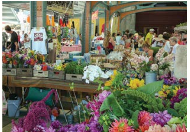
Bellingham Farmers Market, Bellingham, WA

of an expensive structure can create a perceived need for “permanent tenants” such as restaurants or flower shops. Would these businesses conflict with, or compliment, your market?