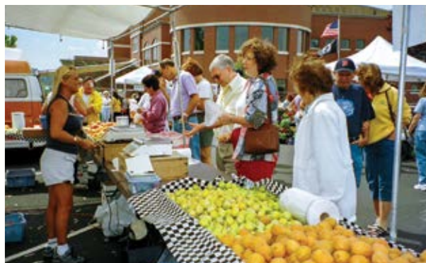
Puyallup Farmers Market, Puyallup, WA

In the market analysis, the committee should also research the rates of success and failure of other markets in the area and assess whether a new market could be a collaborative addition or would impede the