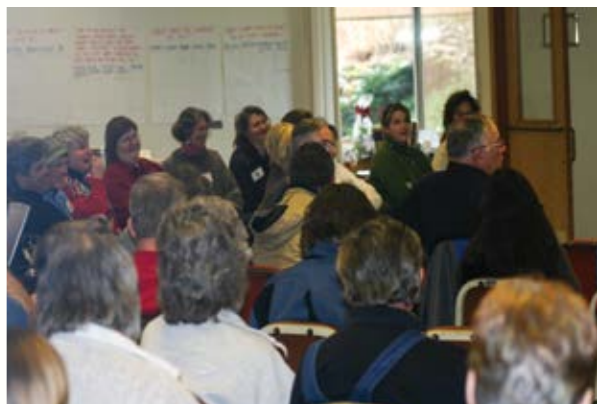
2004 WSFMA Farmers Market Conference WSU Puyallup, WA

Washington's farmers market system has a unique asset in its statewide association, the Washington State Farmers Market Association (WSFMA), one of the two oldest state farmers market associations in the U.S. The WSFMA sets standards for markets, provides access to insurance, offers educational opportunities for farmers, market managers, and board members; and works in partnership with Washington State University (WSU) and the Washington State Department of Agriculture (WSDA). Most farmers markets in Washington belong to the WSFMA and voluntarily abide by its statewide standards. It is important to become familiar with this organization and its programs and, if possible, attend its annual winter conference workshop on market start-up and management.