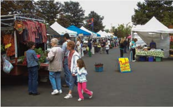
Port Angeles Farmers Market, Port Angeles, WA